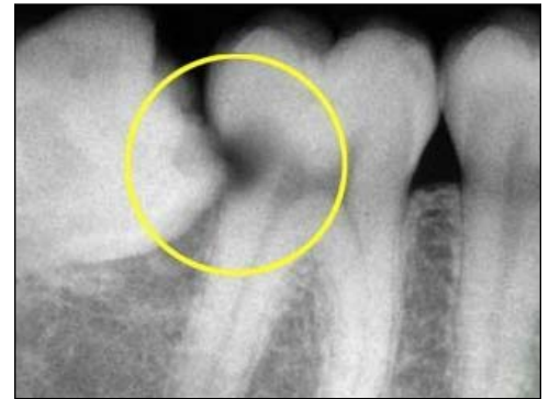
Damage to neighboring tooth

Before we remove your wisdom teeth, we'll thoroughly examine your mouth and teeth, and we'll also take X-rays of the teeth we're going to remove so we can evaluate their roots and the bone that surrounds them. Be sure to tell us about any medical conditions you may have, or problems you've had with previous extractions. You'll also need to tell us about any medications or supplements you're taking, including aspirin, ibuprofen, herbal supplements and any other over-the-counter medicines. If you take oral contraceptives, we'll need to know about that, too, as you could be prone to more problems with healing.