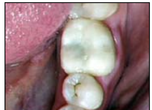
Porcelain inlays look natural

The next step is to take impressions of your teeth, which we then use to make models on which the dental laboratory will craft your porcelain inlay. Sometimes we put a small piece of string in the space between the tooth and the gum. We use the string to gently push the gum away from the tooth so that we get a more complete impression. When we're finished, we place a temporary inlay in your tooth, which you'll wear until your next appointment when we place the porcelain inlay.