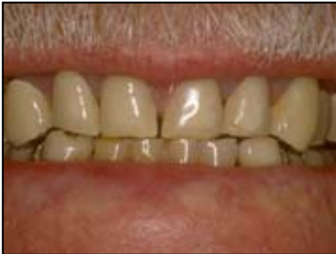
Worn teeth due to bruxism

Bruxism is the clenching or grinding of your teeth while you are asleep. It is not just an annoyance; it exerts thousands of pounds of pressure on the biting surfaces of the teeth, which can lead to jaw pain and damage to your teeth, as well as to the surrounding bone, gums, and jaw joint. Left untreated, bruxism can cause: