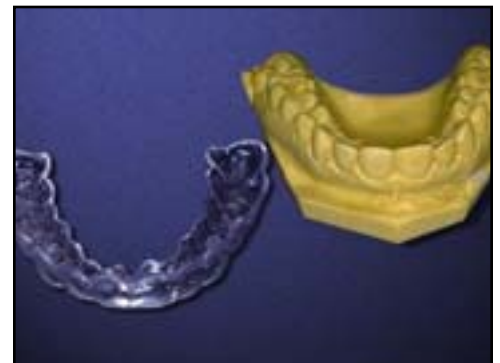
A model is used to create a nightguard