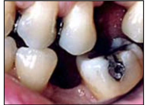
Teeth can shift

If you're interested in replacing a missing tooth with an implant, we will perform a thorough evaluation to determine whether your health and lifestyle make you a good candidate for this kind of restoration.