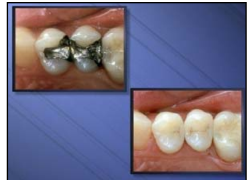
We can replace silver fillings with white

All of these problems can be solved with cosmetic procedures, so even if you weren't born with a beautiful smile, you can still have one.